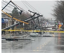
10 of the Craziest Images From Last Week's Nor'easter