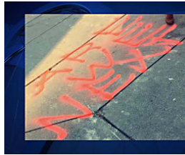
'ARE WE NEXT': Wellesley School Officials Investigate Graffiti Found on Middle...