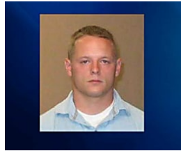
Authorities: Cop Raped Woman During National Guard Training