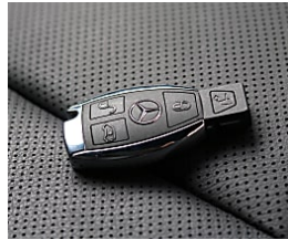
5 Things Car Salesmen Don't Want You To Know Women's Article