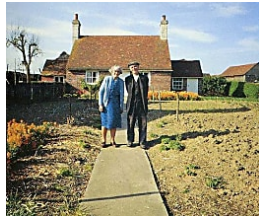
Elderly Couple Took The Same Photo Every Season... Golden Age Memories