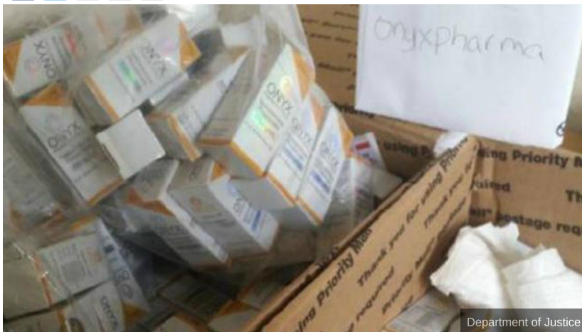
Department of Justice

Six people are facing charges in connection with a conspiracy to traffic counterfeit steroids, according the Department of Justice.