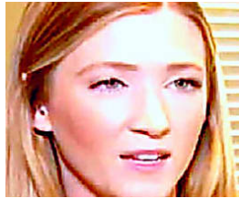
Babysitter Warns Dad About Noise Upstairs, So He... LifeDaily.com