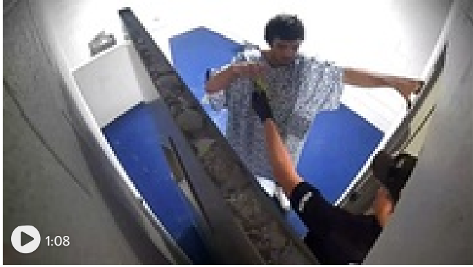
Surveillance video shows suspect in chainsaw case attacking officer