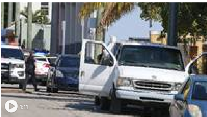
Van, police call a 'mobile bomb,' containing over 250 gallons of gas found in Little Havana