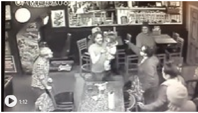
Video shows man in bar fight while holding his 4-year-old daughter