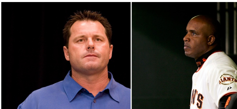
Roger Clemens and Barry Bonds don't deserve the Hall of Fame, says a new Seton Hall poll of Americans.

The people agree with Joe Morgan: No steroid users in the Hall of Fame. That's according to a new poll from Seton Hall University , which surveyed people across the country late last month about their thoughts on the National Baseball Hall of Fame, Barry Bonds, Roger Clemens and Joe Morgan's letter to voters asking that suspected steroid users be kept out . The people polled — 729 of them — were definitely on Morgan's side: • 62 percent of people surveyed said that “players with a history of performance-enhancing drug use” should not be allowed into the Hall of Fame. Of the rest, 12 percent of people had no opinion and 26 percent said let 'em in. • 49 percent of people said Bonds and Clemens should not be in the Hall of Fame, while 35 percent of people said yes and 16 percent said they didn't know or have an opinion. Those two points seem like similar ideas, but they're not. Bonds and Clemens never failed PED tests while they were playing, nor were they suspended for drug use. So the 13 percent difference in the two questions could be people who see the nuance between them and someone like Manny Ramirez, who is on the ballot too, has Hall of Fame stats